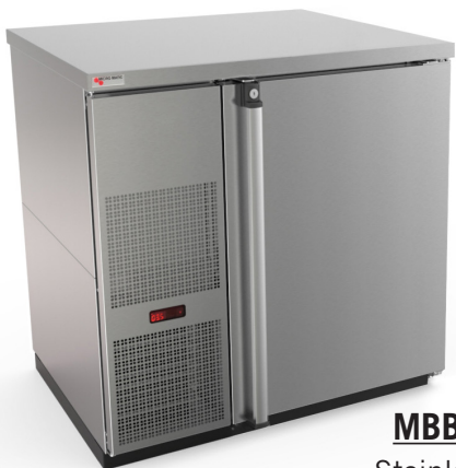
MBB36S-E Stainless Steel