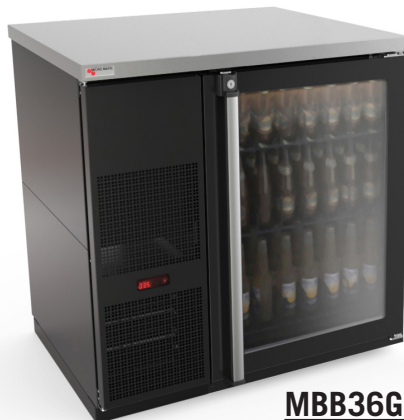
MBB36G-E Black with Glass Door