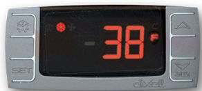
Adjustable Digital Thermostat! Easy to read exterior mounted