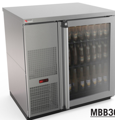
MBB36GS-E Stainless Steel with Glass Door