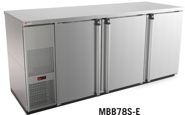
MBB78S-E Stainless Steel