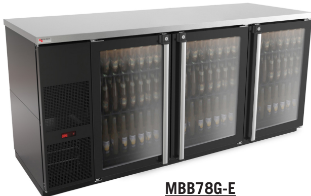
MBB78G-E Black with Glass Doors