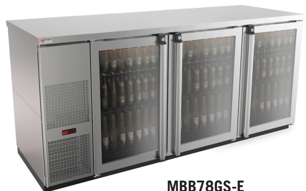
MBB78GS-E Stainless Steel with Glass Doors