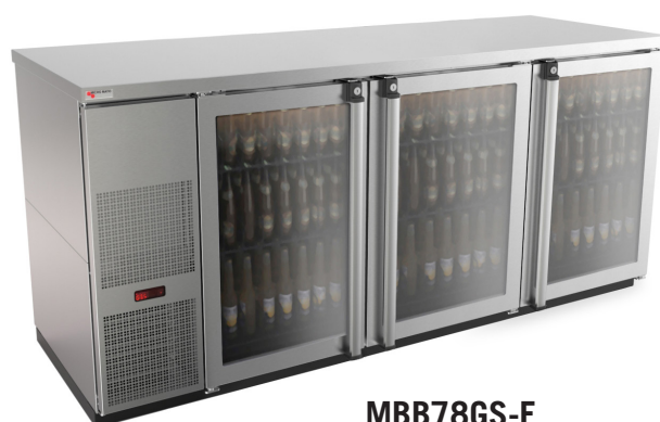
MBB78GS-E Stainless Steel with Glass Doors