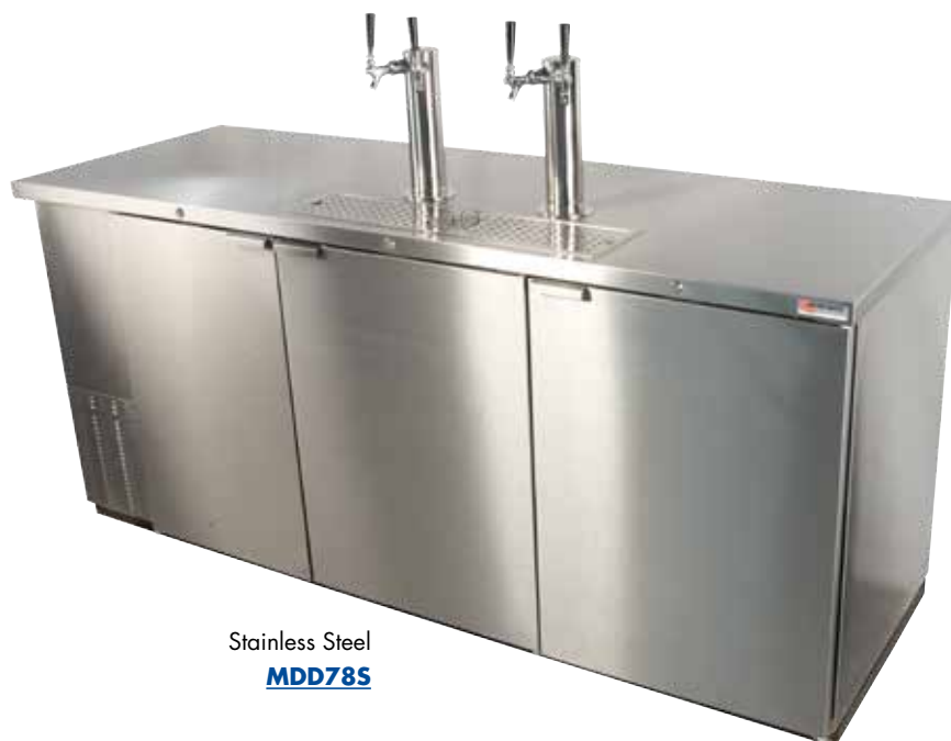
Stainless Steel MDD78S