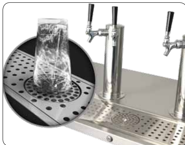
▶ Integrated cold water glass rinser.