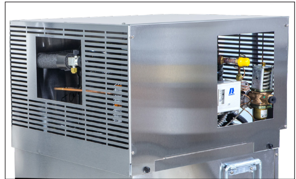
Reverse side showing water connections.