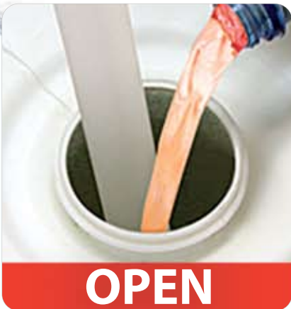
Stinger / Drum Pump

Micro Matic offers the only proprietary tamper-evident DEF Container Valve System that is Closed, Sealed & Secure from fill to dispense.