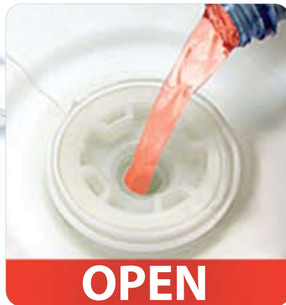
Probe / Dip Tube