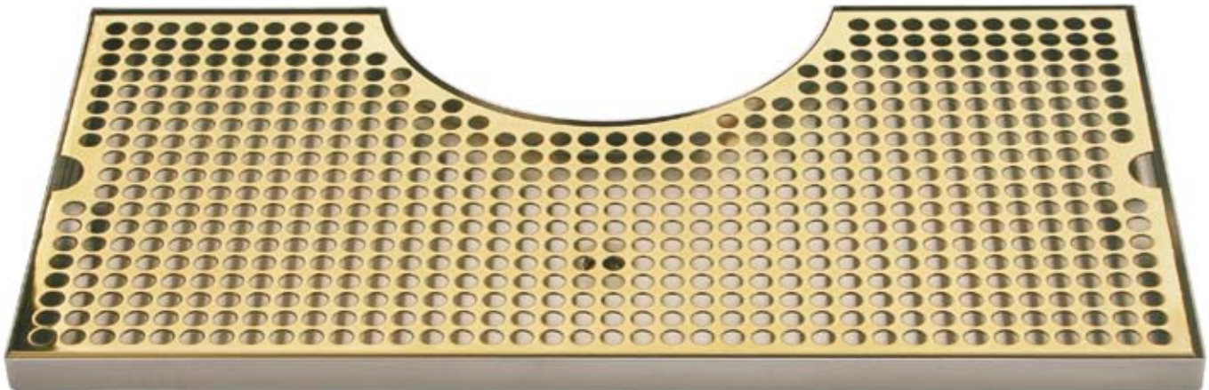
PVD Brass BVL-120LDSSPVD