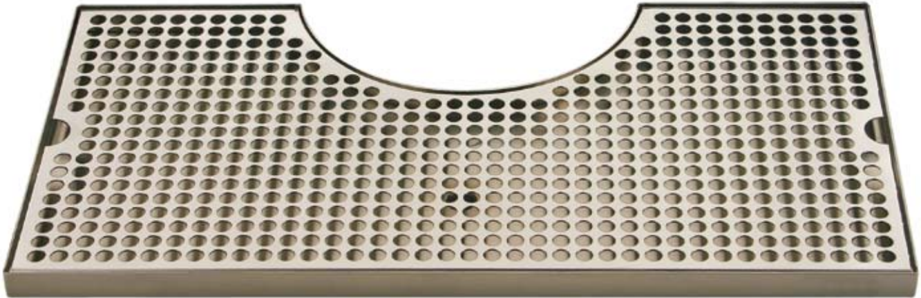
Stainless Steel BVL-120LDCH