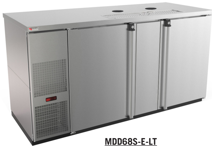
MDD68S-E-LT Stainless Steel