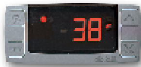
Adjustable Digital Thermostat! Easy to read exterior mounted