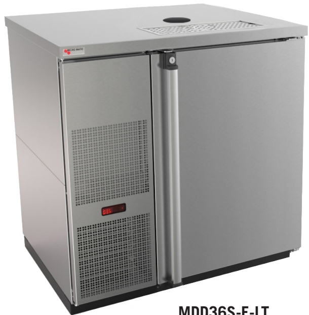
MDD36S-E-LT Stainless Steel