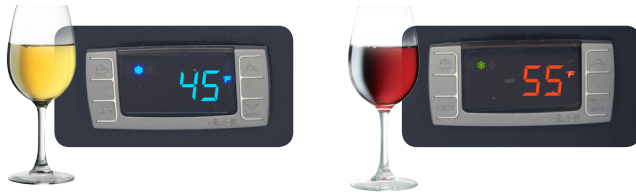
Dual-Temperature: Built In Digital Thermostats