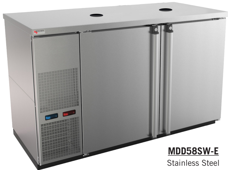
MDD58SW-E Stainless Steel