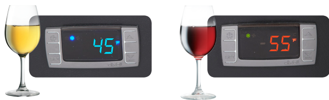
Dual Temperature: Built In Digital Thermostats