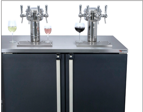
Shown: 2 Wine Fonts (MTM-4PSS-W), 2 Drip Trays (DP-1020). Order separately.