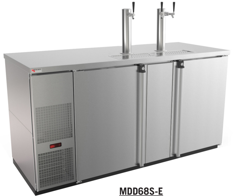
MDD68S-E Stainless Steel