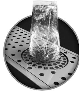
Integrated water glass rinser