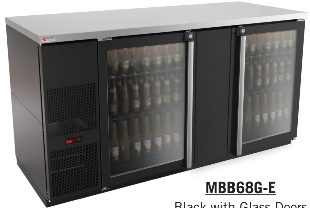
MBB68G-E Black with Glass Doors