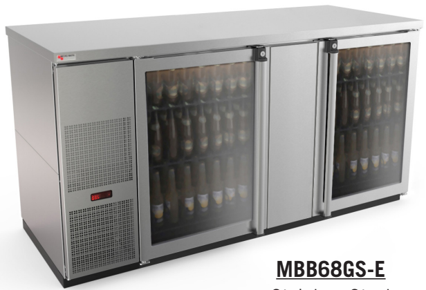
MBB68GS-E Stainless Steel with Glass Doors