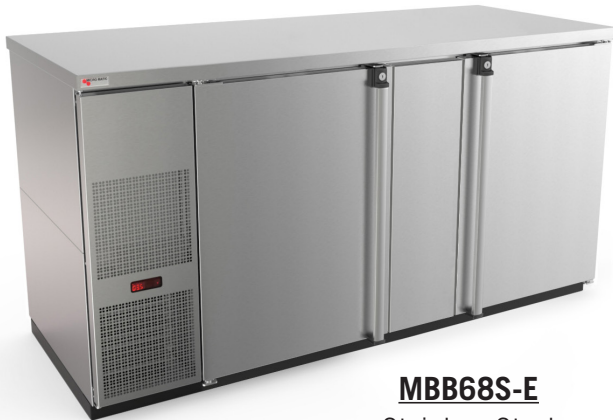
MBB68S-E Stainless Steel