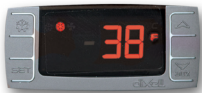
Adjustable Digital Thermostat! Easy to read exterior mounted