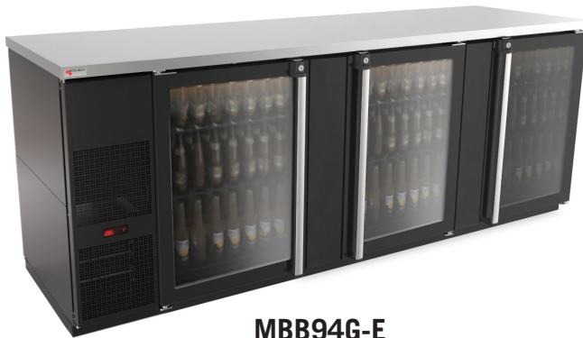
MBB94G-E Black with Glass Doors