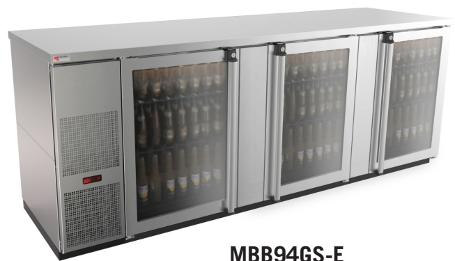
MBB94GS-E Stainless Steel with Glass Doors