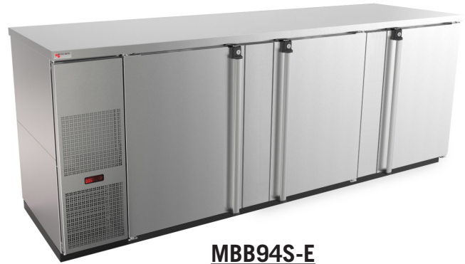
MBB94S-E Stainless Steel