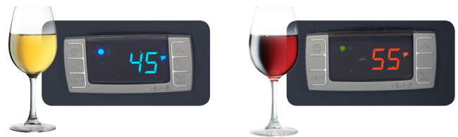
Dual-Temperature: Built In Digital Thermostats