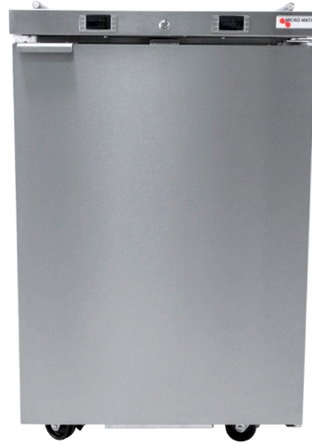
MDD23SW-E Stainless Steel