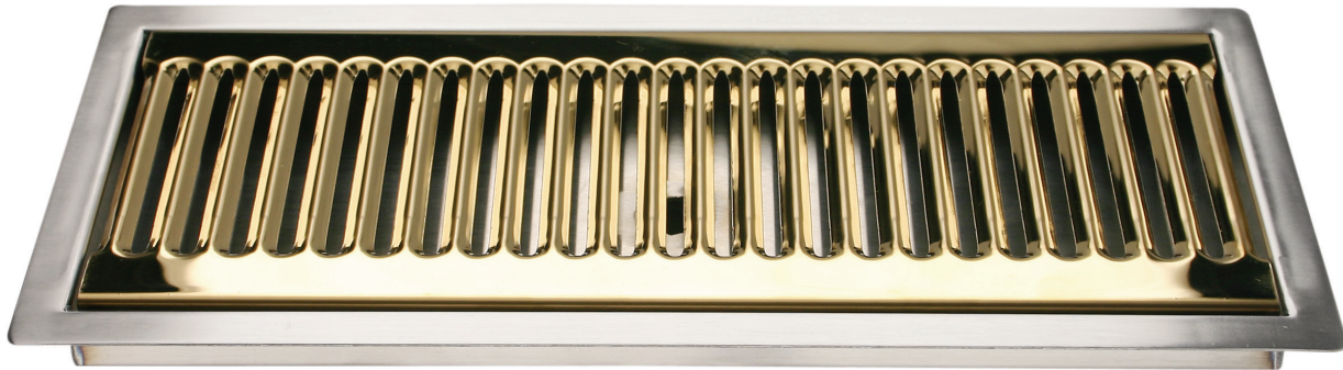
DP-220DSSPVD PVD Brass / Stainless Steel