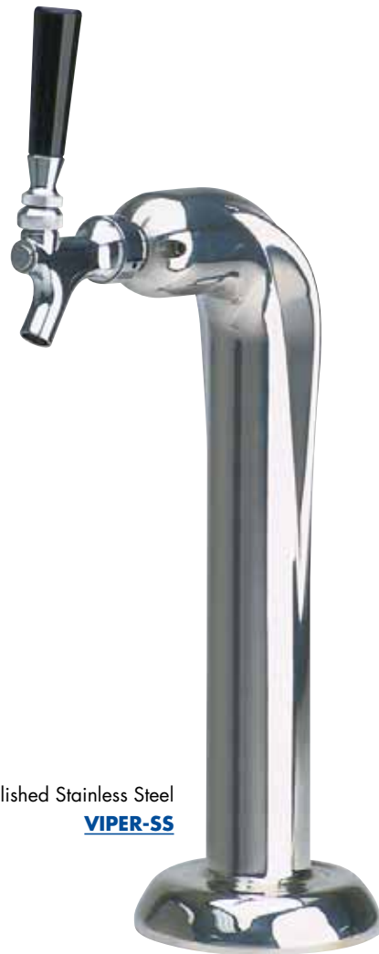
Polished Stainless Steel VIPER-SS