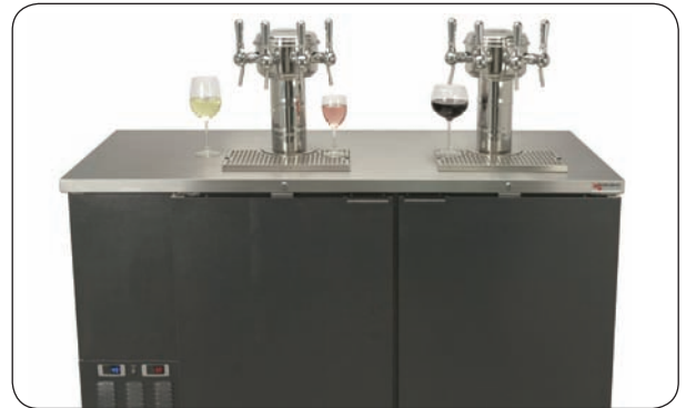
► Shown: 2 Wine Fonts MTM-4PSS-W, 2 Drip Trays DP-1020. Order separately.