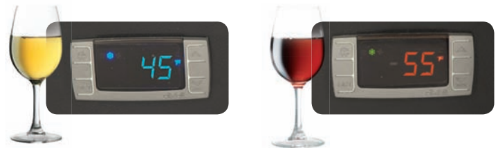
► Dual Temperature: Built In Digital Thermostats.