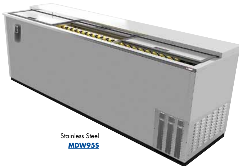
Stainless Steel MDW95S