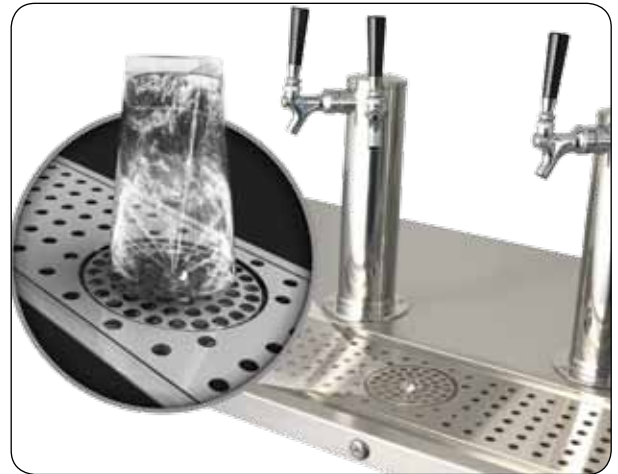
▶ Integrated cold water glass rinser.