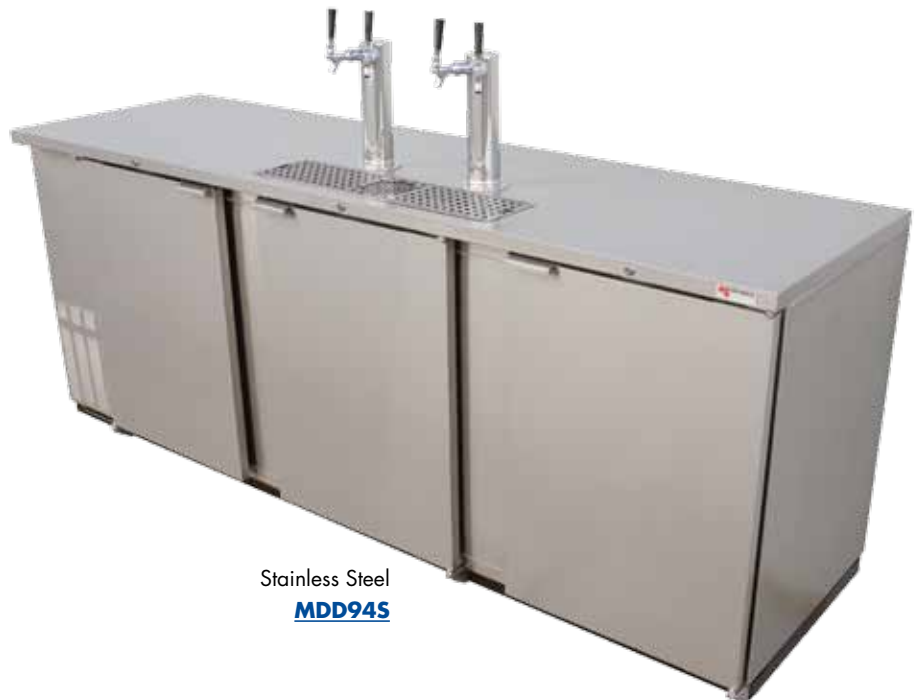
Stainless Steel MDD94S