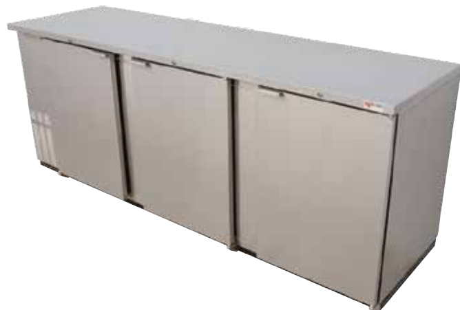
Stainless Steel MBB94S