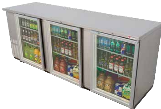
Stainless Steel with Glass Doors MBB94GS