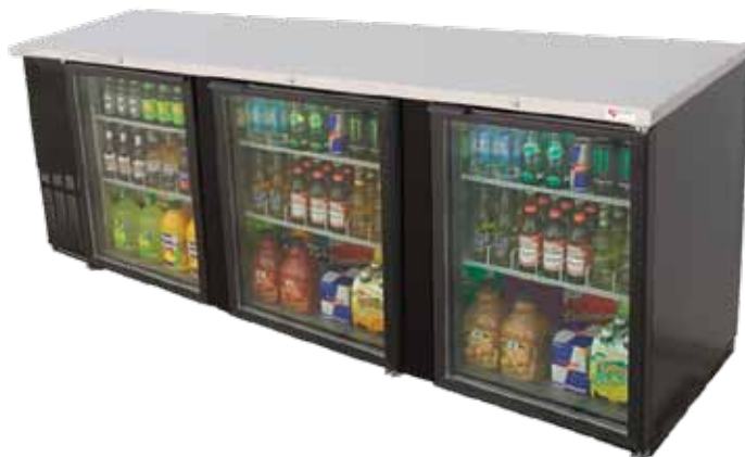
Black with Glass Doors MBB94G