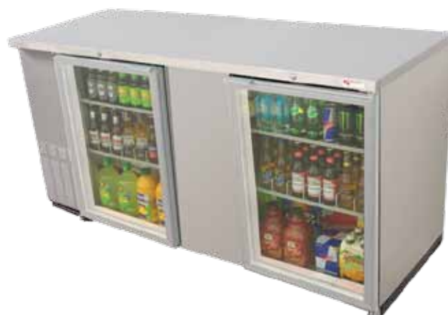
Stainless Steel with Glass Doors