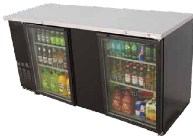
Black with Glass Doors