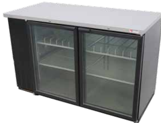
Black with Glass Doors