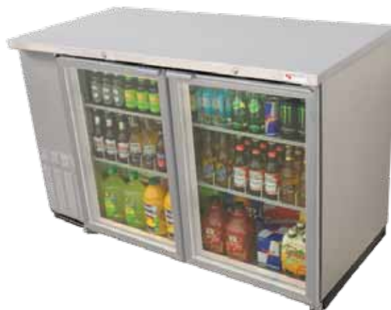
Stainless Steel with Glass Doors