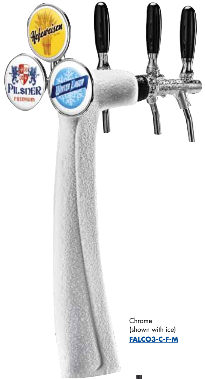
Chrome (shown with ice) FALCO3-C-F-M