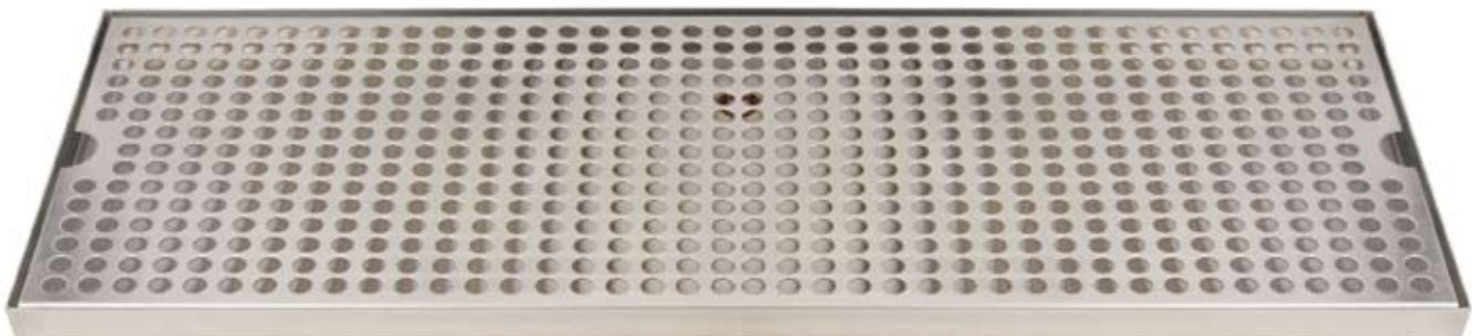
Stainless Steel DP-820D-24