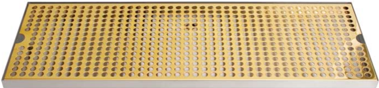
PVD Brass DP-820DSSPVD-24