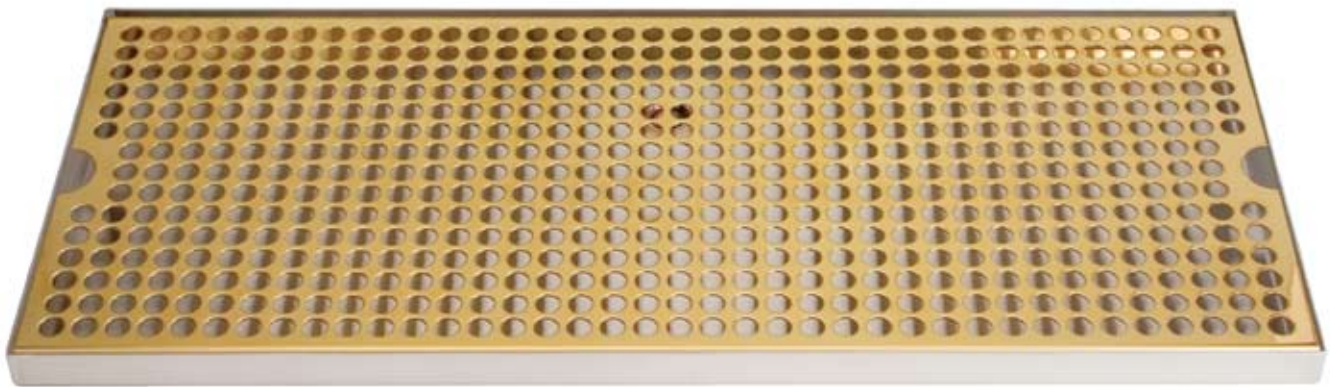
PVD Brass DP-820DSSPVD-20