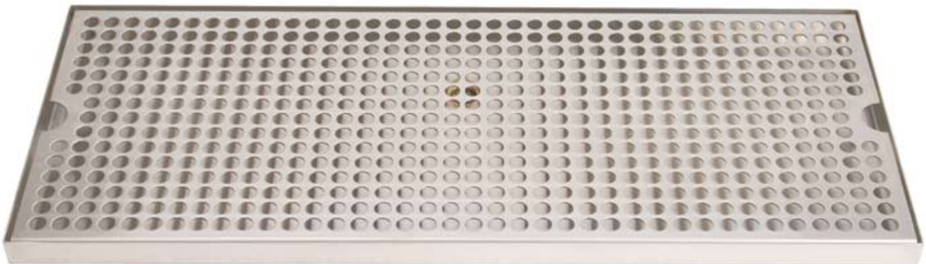
Stainless Steel DP-820D-20