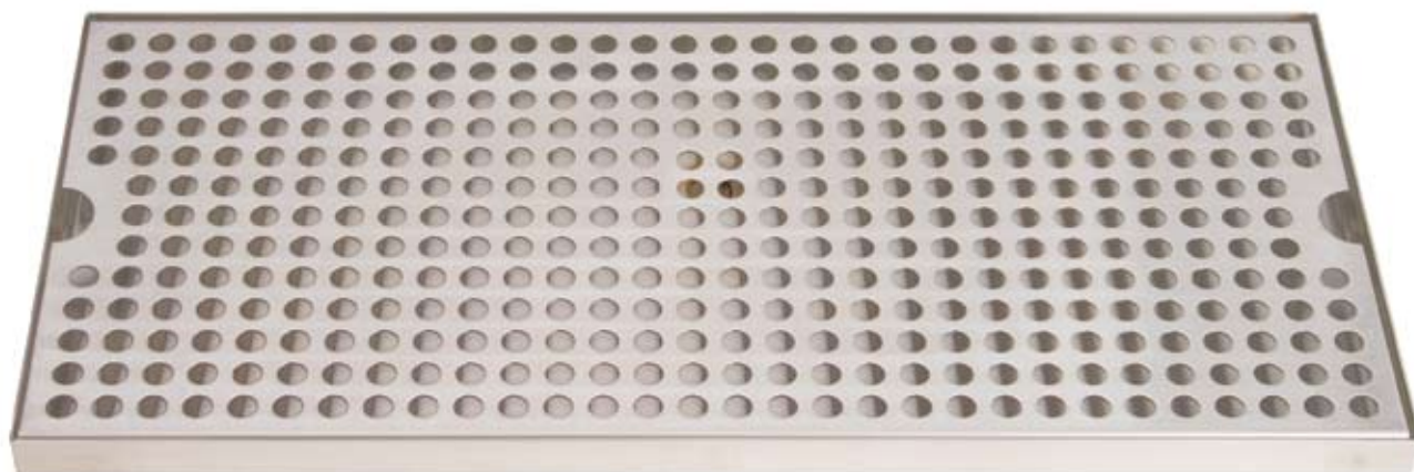
Stainless Steel DP-820D-18