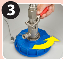
3 Turn Handle Counter-Clockwise