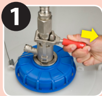
1 Pull Out Handle