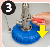
3 Push Down Handle