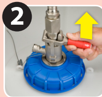
2 Handle Unlocks & Releases Up