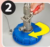
2 Turn Handle Clockwise