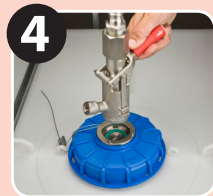
4 Pull up to Remove