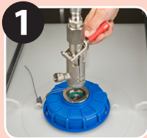
1 Insert Coupler