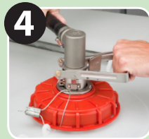
4 Handle Clicks, Locks & Remains Down