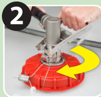
2 Turn Handle Clockwise