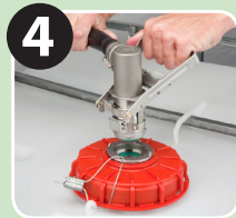
4 Pull up to Remove