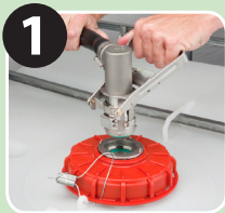
1 Insert Coupler