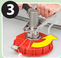
3 Turn Handle Counter-Clockwise