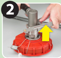
2 Handle Unlocks & Releases up