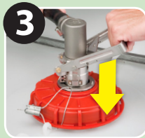
3 Push Down Handle