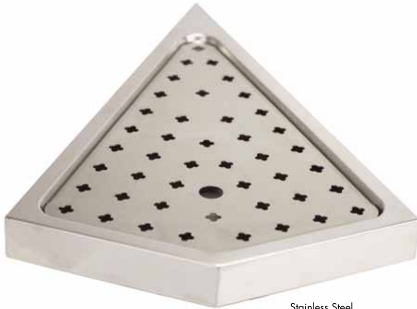
Stainless Steel DP-1601