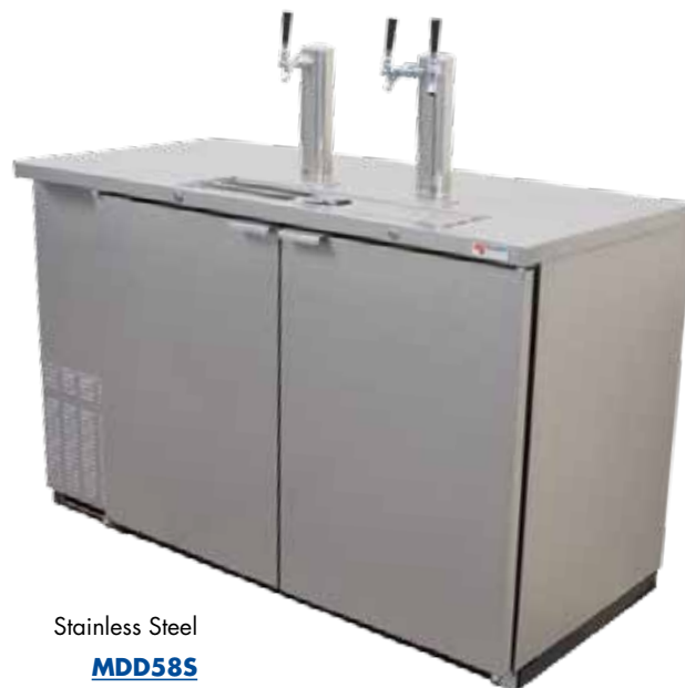
Stainless Steel MDD58S