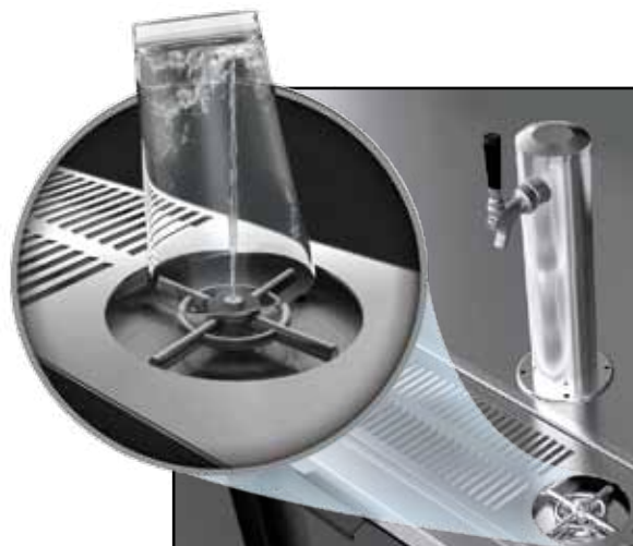
▶ Integrated cold water glass rinser.