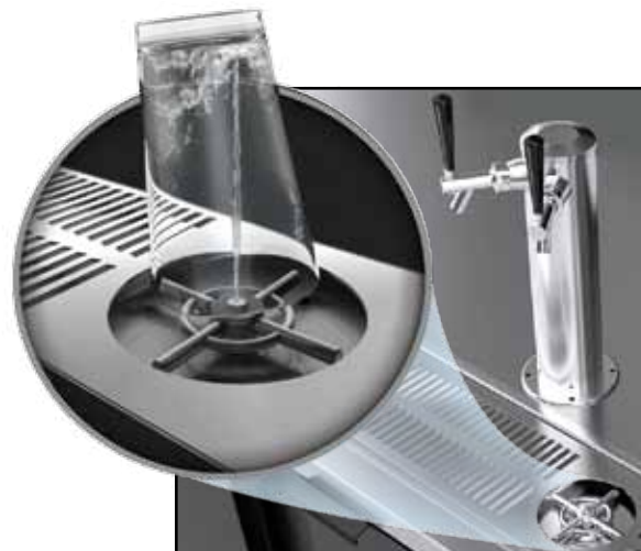
▶ Integrated cold water glass rinser.