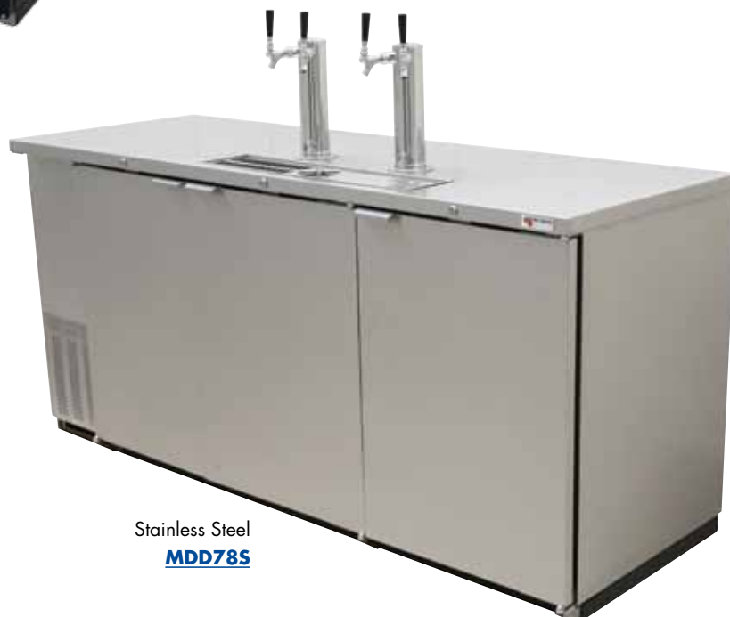
Stainless Steel MDD78S