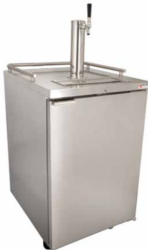
Stainless Steel MDD23S